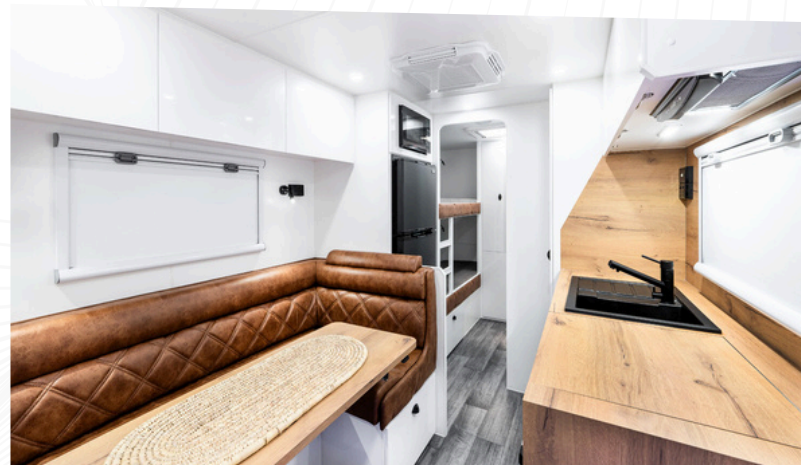
FAMILY VAN CENTRE DOOR ENTRY