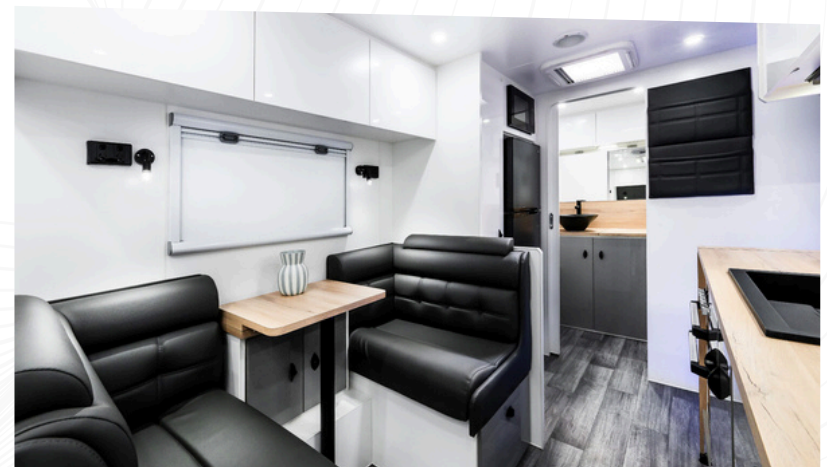
COUPLES VAN REAR DOOR ENTRY