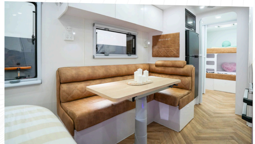
FAMILY VAN CENTRE DOOR ENTRY