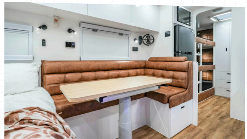
FAMILY VAN CENTRE DOOR ENTRY