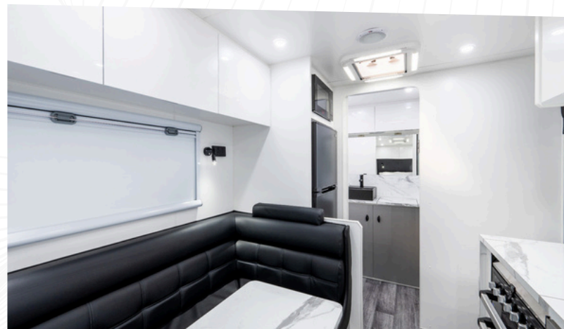
COUPLES VAN REAR DOOR ENTRY