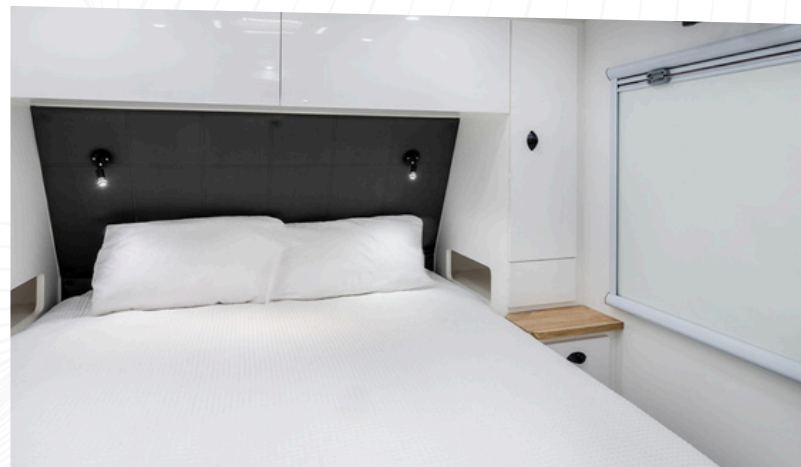
COUPLES VAN REAR DOOR ENTRY